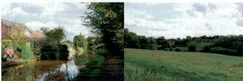
Table 5: What does your household like about Odd Rode?

This information, together with the responses on residents' dislikes, will be used (with information from the Parish Plan, Census data, etc) to form a vision for our parish.